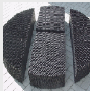
Internals for gas scrubbers

Bulk or structured packing for gas scrubbers.