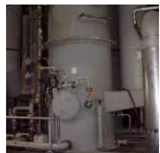
NH 3 stripping tower